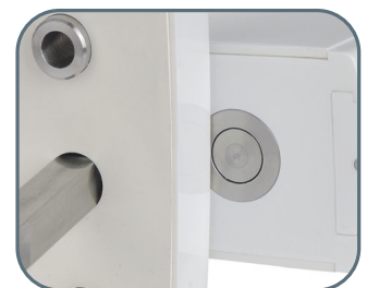
Electromechanical handle lock