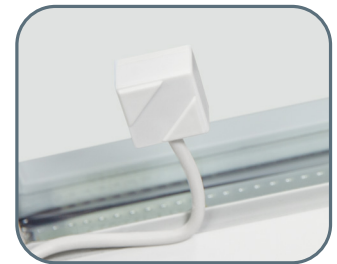
Interface for glass break detector

The market launch is scheduled for April/May 2024 with the ETS order number H-6010-XXX. The planned launch price via online retailers will be around EUR 195.00 including tax.